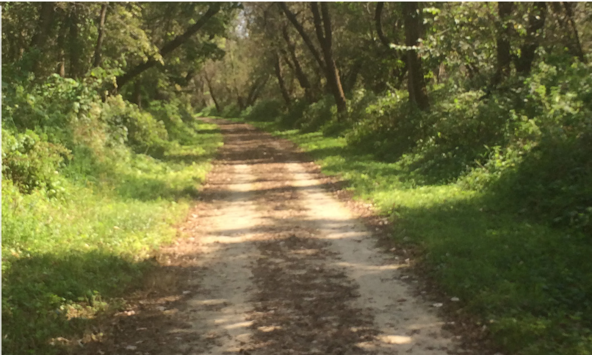
Pony Hollow Trail (Elkader, Iowa)