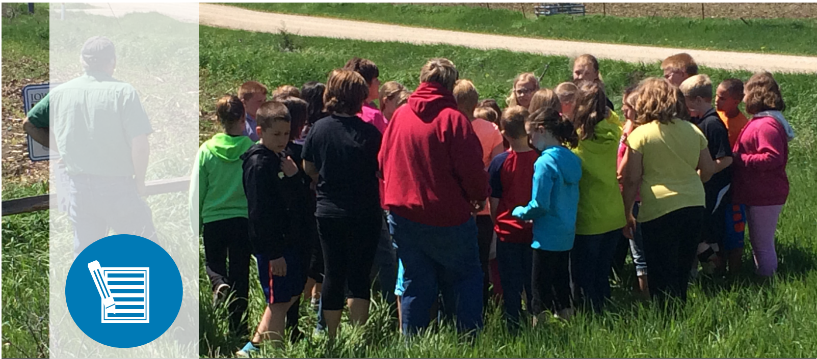
Students participating in the Turkey River Safari - May 2016