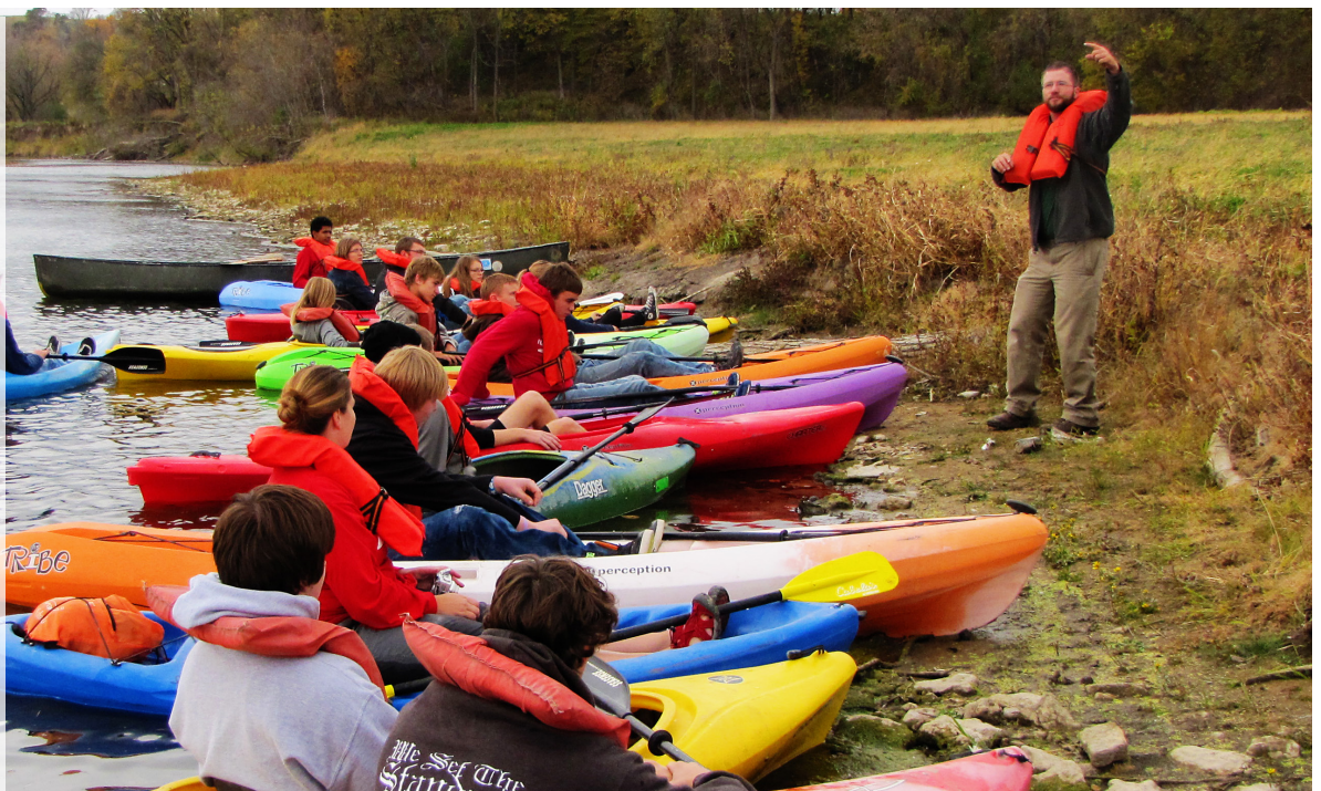
River Safety Demonstration (Turkey River)