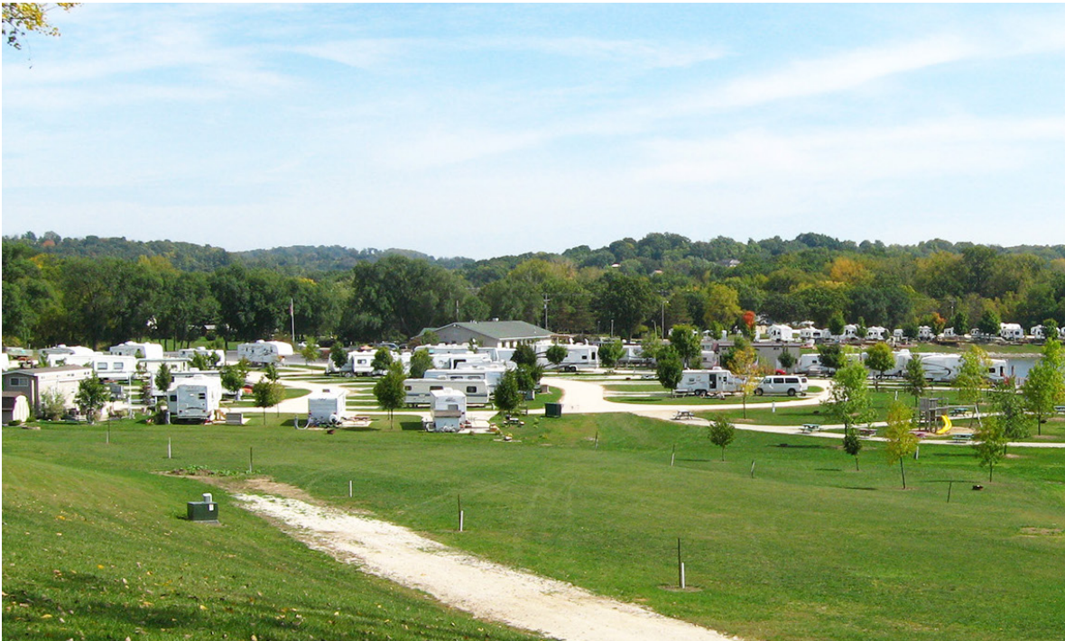
Camping/Recreational Photoshoot - October 2016