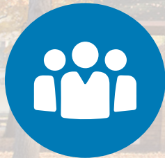
Clermont City Park (Clermont, Iowa)