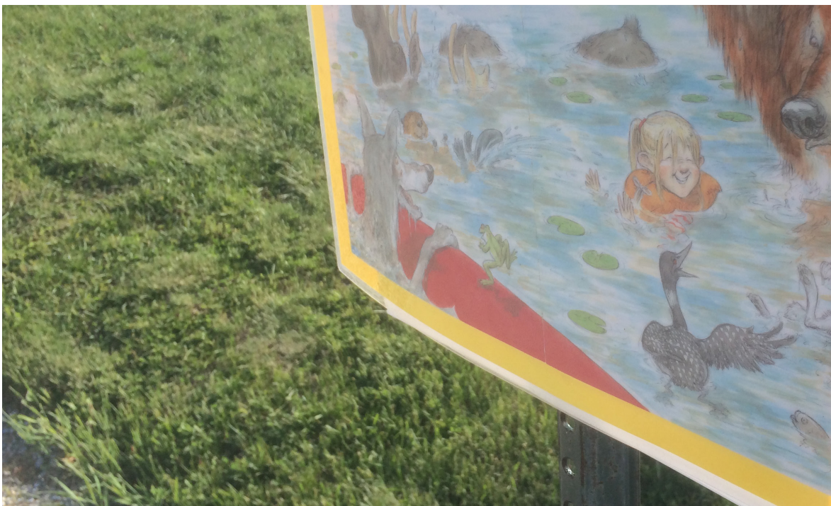
StoryWalk (Clermont, Iowa)