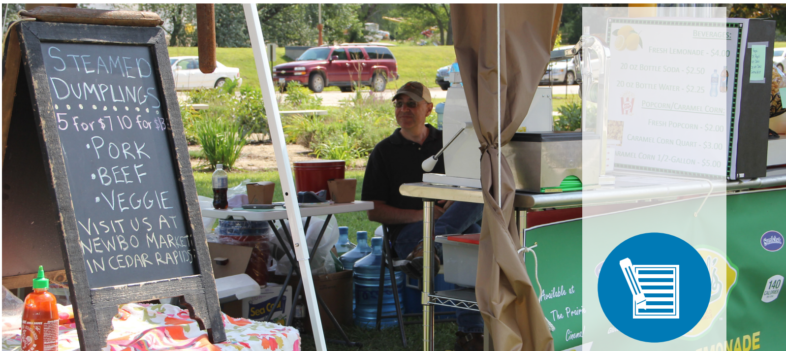
Art in the Park (Elkader, Iowa) - August 2015