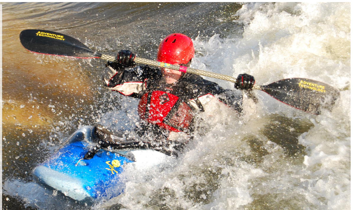
Whitewater Course (Elkader, Iowa)