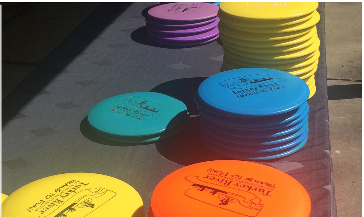
Disc Golf Workshop (Elkader, Iowa) - May 24th, 2016