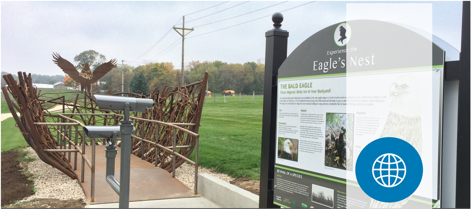
Eagle's Nest (Elgin, Iowa)