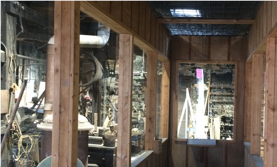
Clermont Blacksmith Shop (Clermont, Iowa)