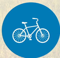
TRRC Trail Bridge (Elgin/Clermont, Iowa)