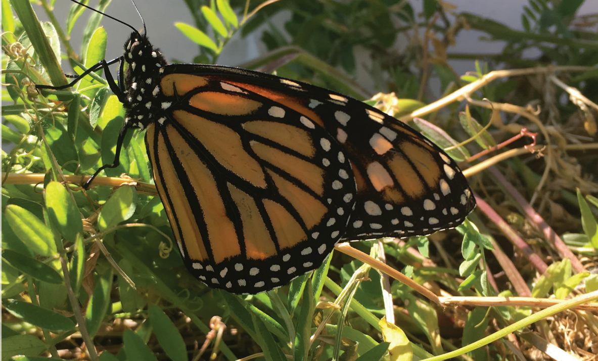
Music & Monarchs 2017 - Elkader, Iowa