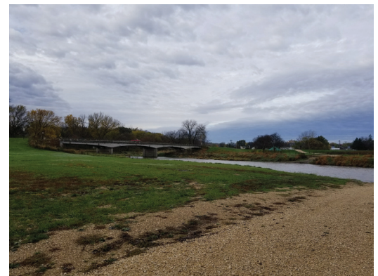
Future Trail Bridge Location - Elgin to Gilbertsons

Elgin-Gilbertson Trail Expansion Project in Progress