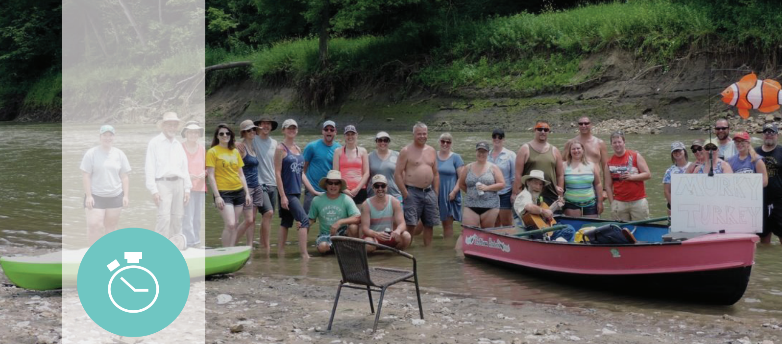
Murky Turkey Floatilla - July 15th, 2017