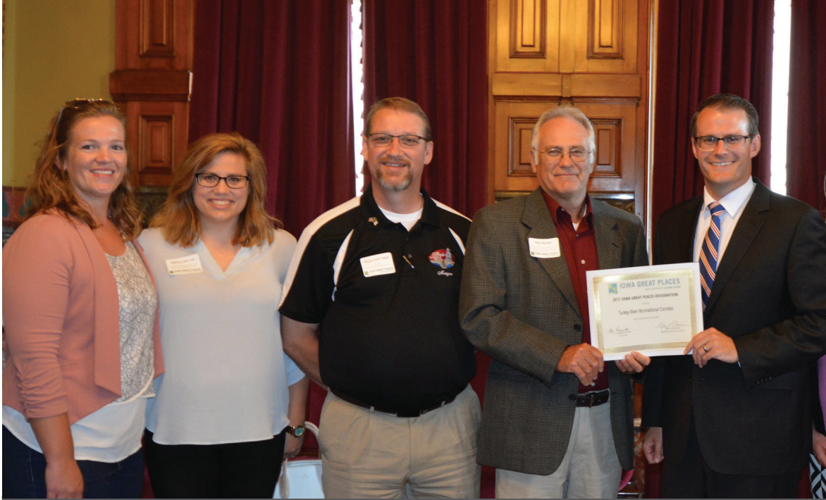
Iowa Great Places Designation Ceremony - August 25th, 2017