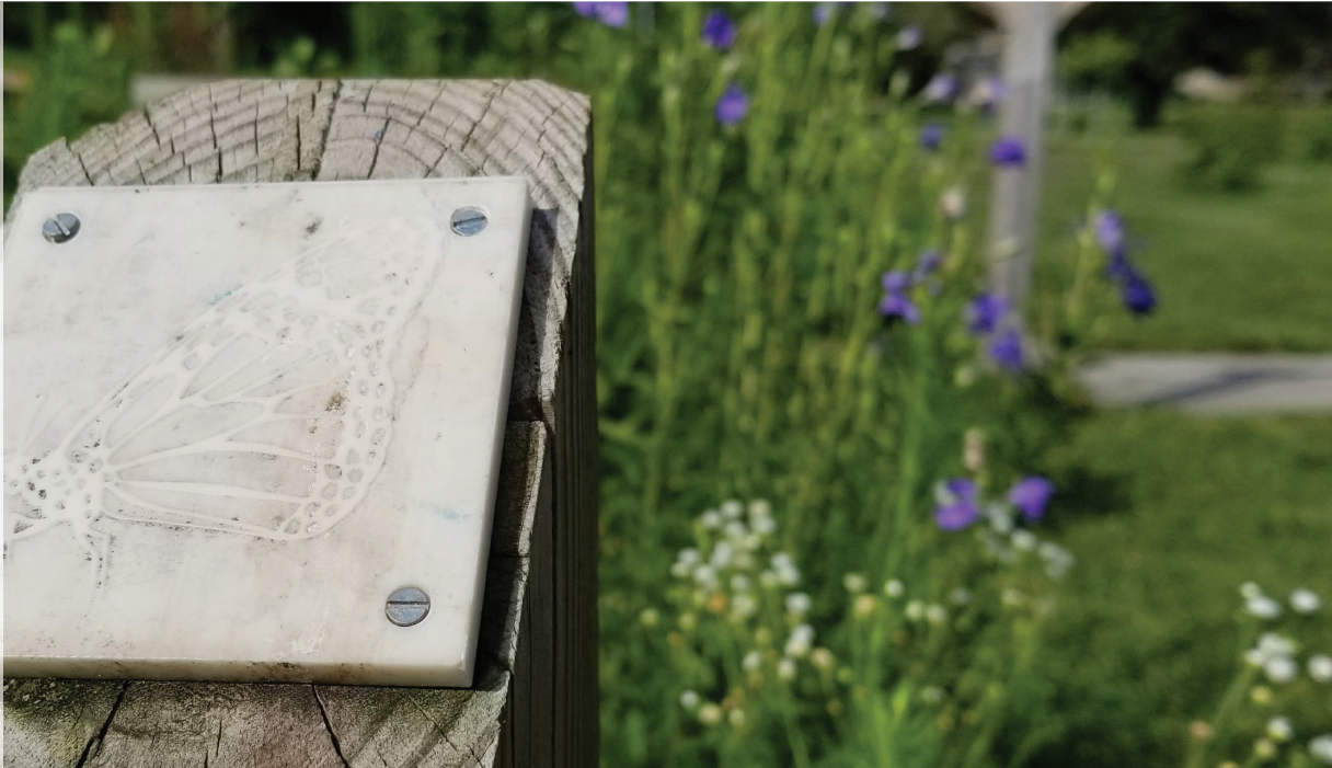
2017 Turkey River Safari post located at Founders' Park - Elkader, Iowa