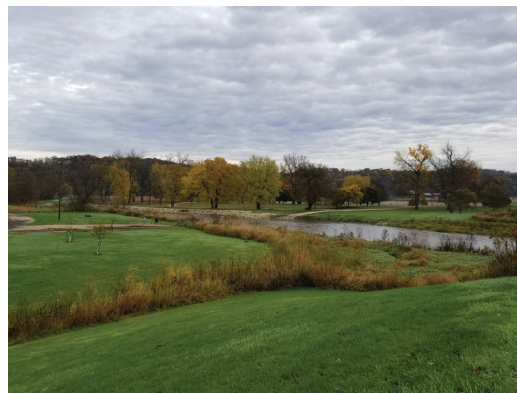
Future Trail Bridge Location - Gilbertsons to Elgin

This grant was written by the TRRC Director and Northeast Iowa RC&D staff, with assistance from the Fayette County Conservation Board. $1,437,000.00 total is currently secured for the project.