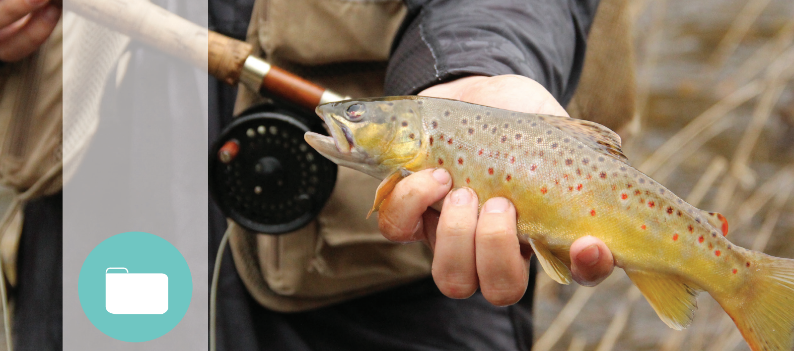
Fishing in the Turkey River Recreational Corridor