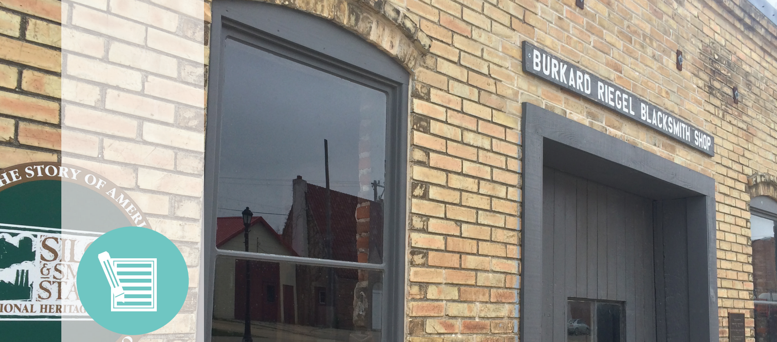
Burkard Riegel Blacksmith Shop - Clermont, Iowa