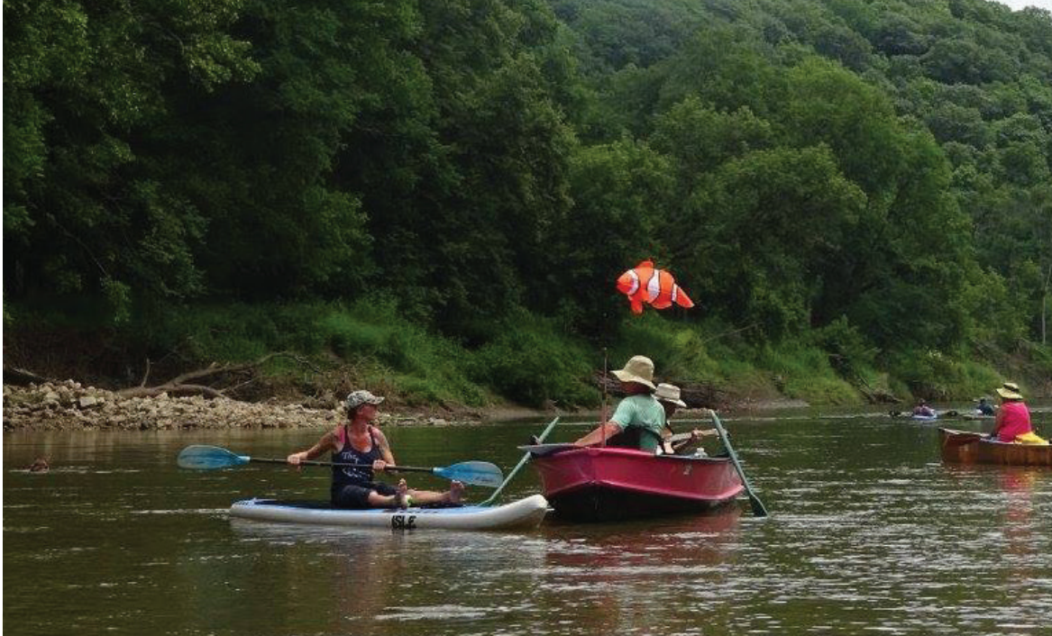
Murky Turkey Floatilla - July 15th, 2017