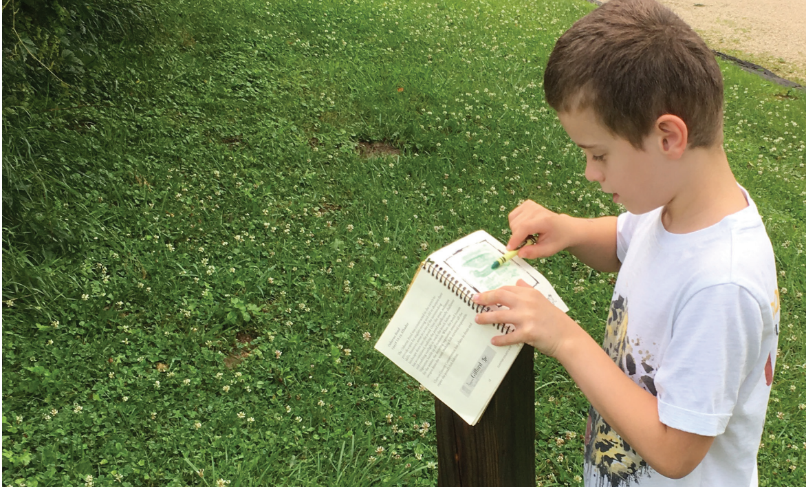
2017 Turkey River Safari Participant