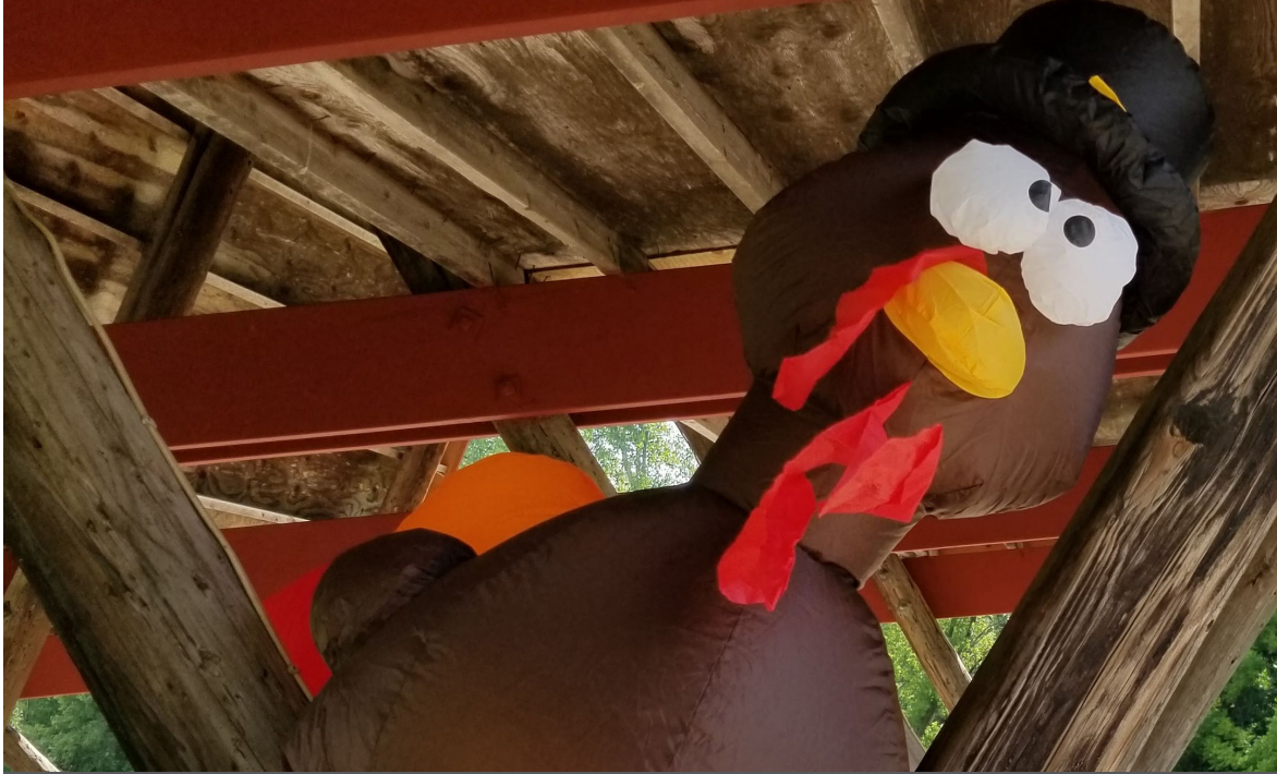
2018 Osborne Disc Golf Tournament - Elkader, Iowa