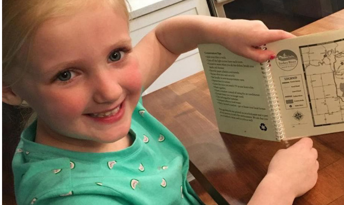
2018 Turkey River Safari Participant