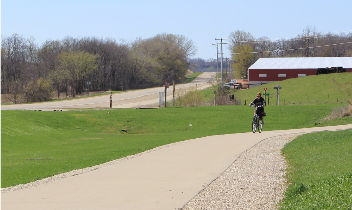
Trail User - Fayette County, Iowa