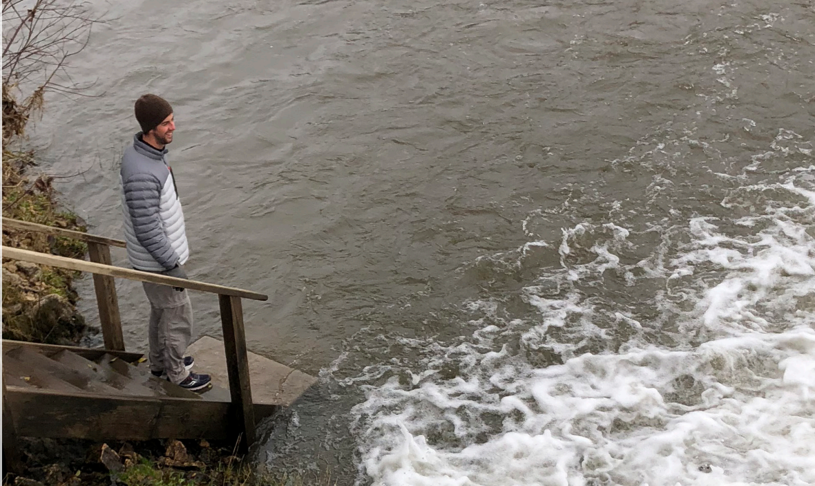
Big Springs Trout Access - Clayton County, Iowa