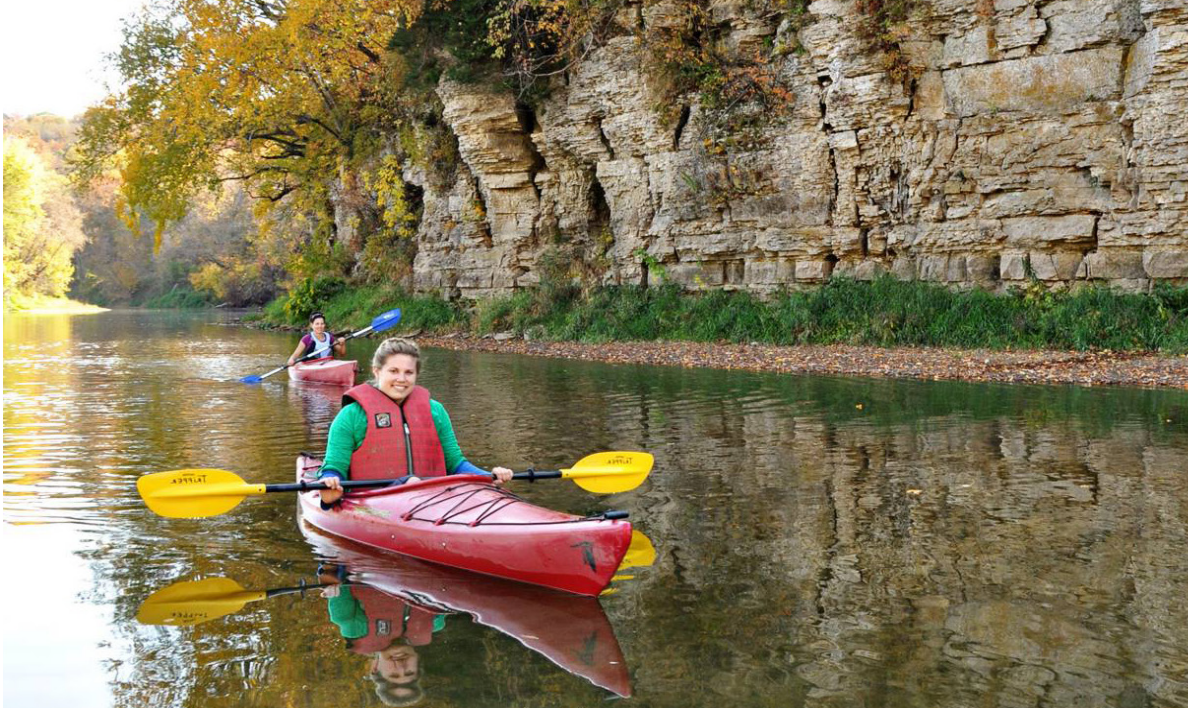
Elkader to Motor Mill Turkey River