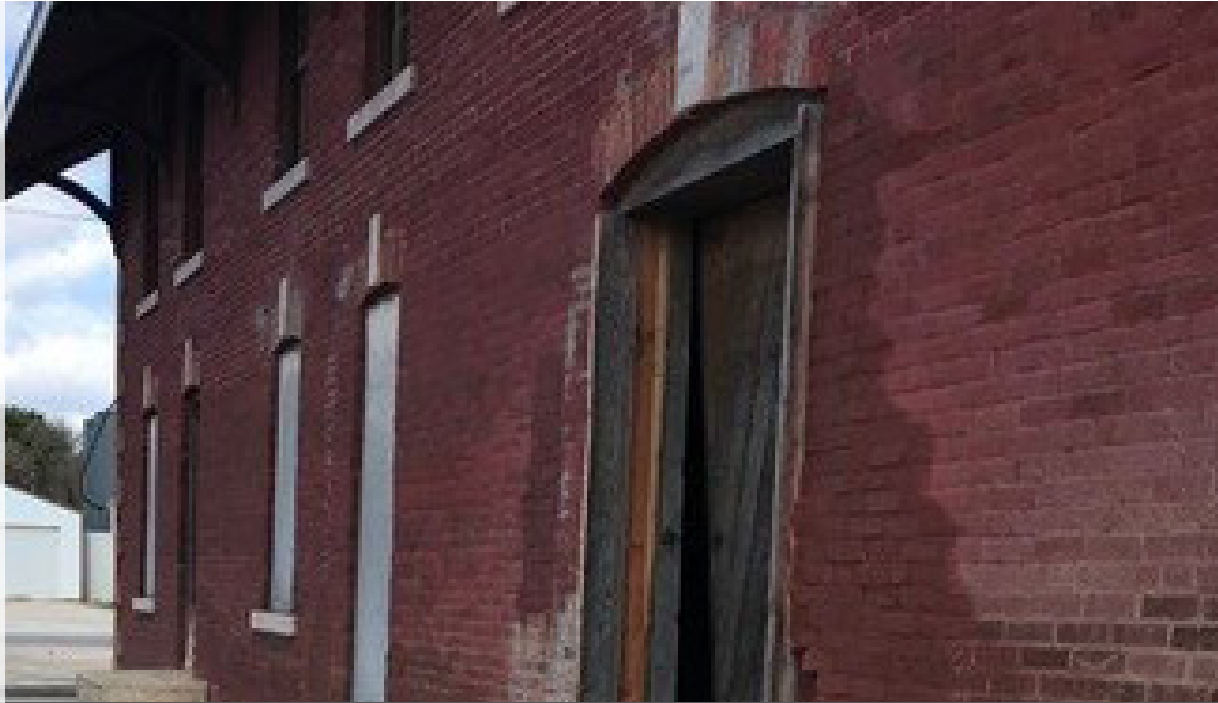
Clermont Depot - Clermont, Iowa