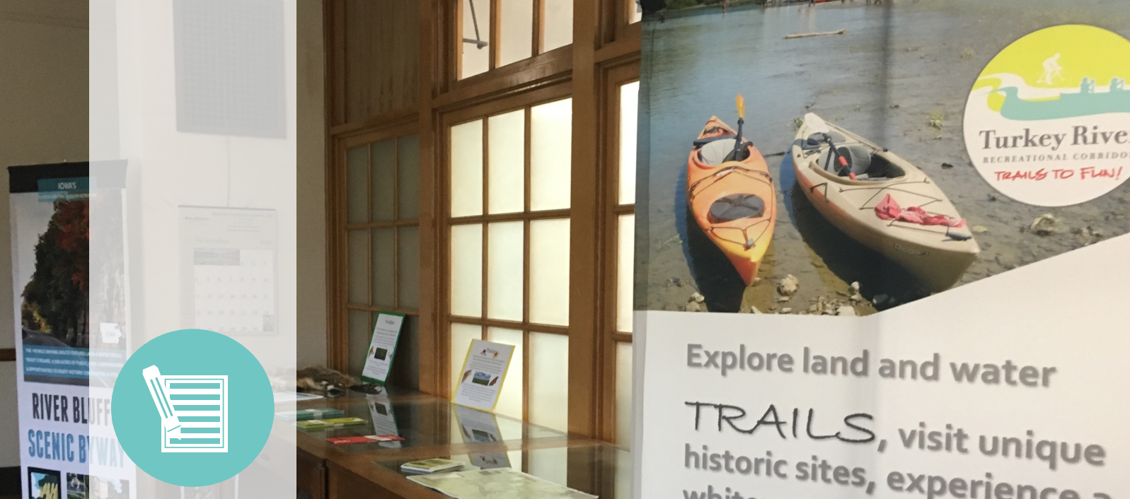
Fayette County Pocket Nature Center - West Union, Iowa