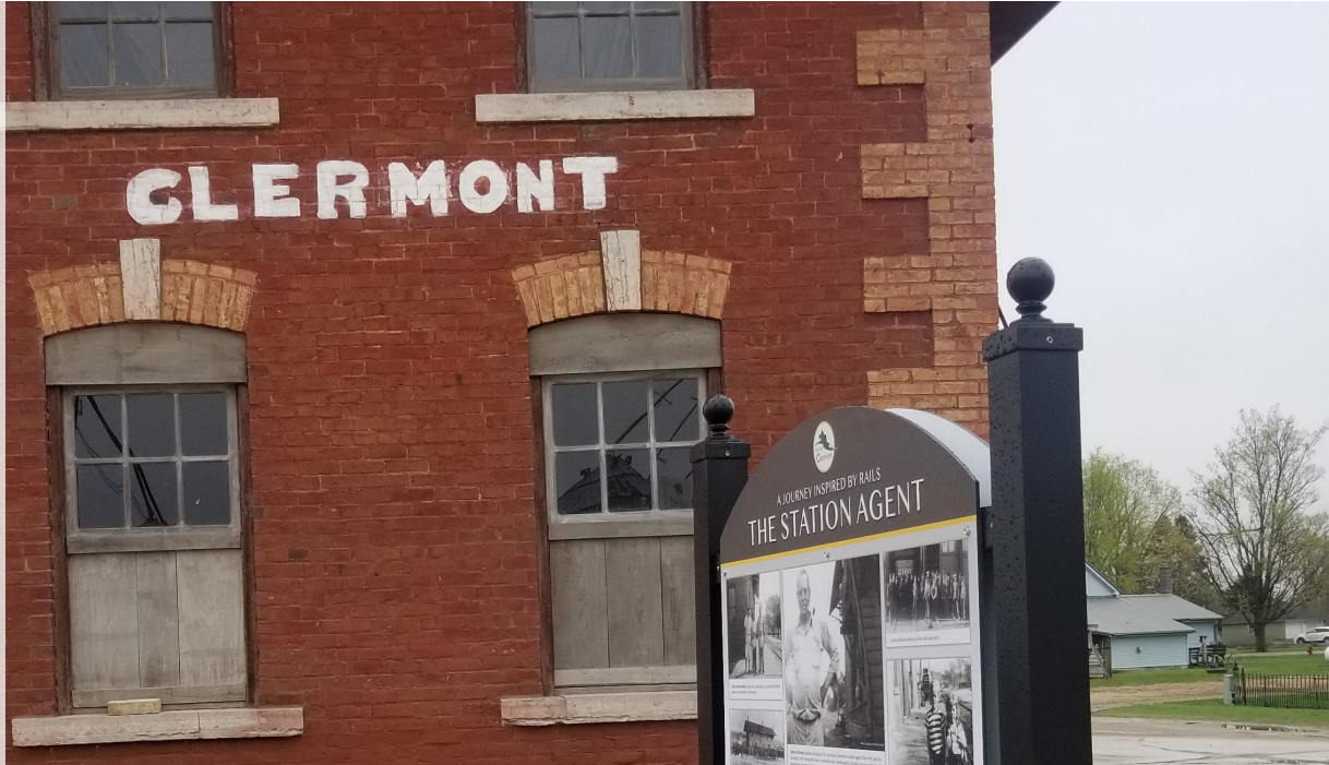
Clermont Depot - Clermont, Iowa