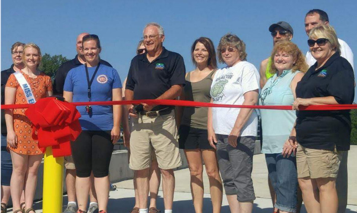
TRRC Trail Grand Opening - Elgin, Iowa