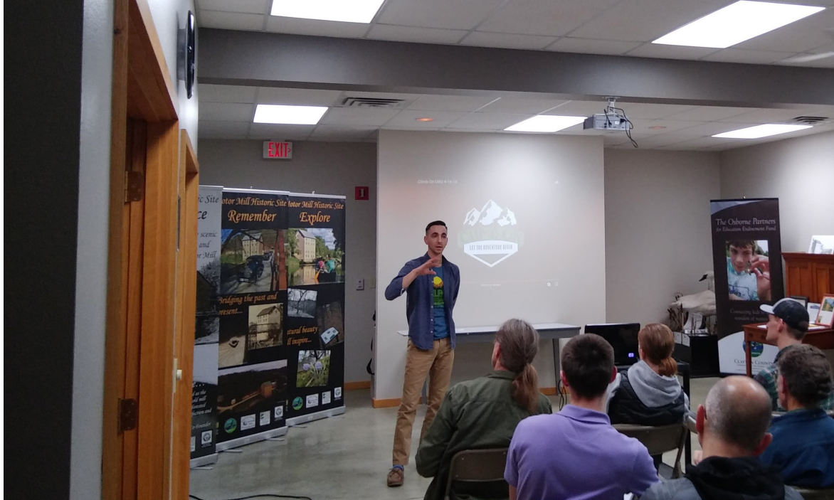
January, 2019 Recreational Workshop - Elkader, Iowa