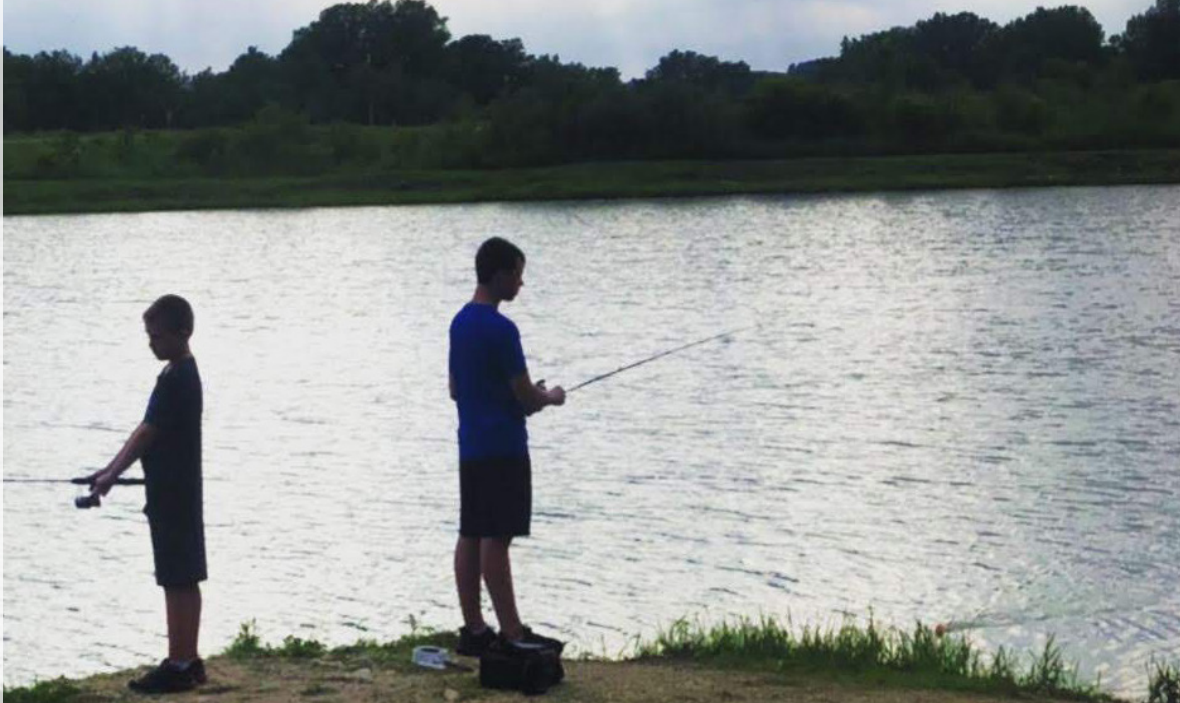
Gilbertson Conservation Education Area - Elgin, Iowa