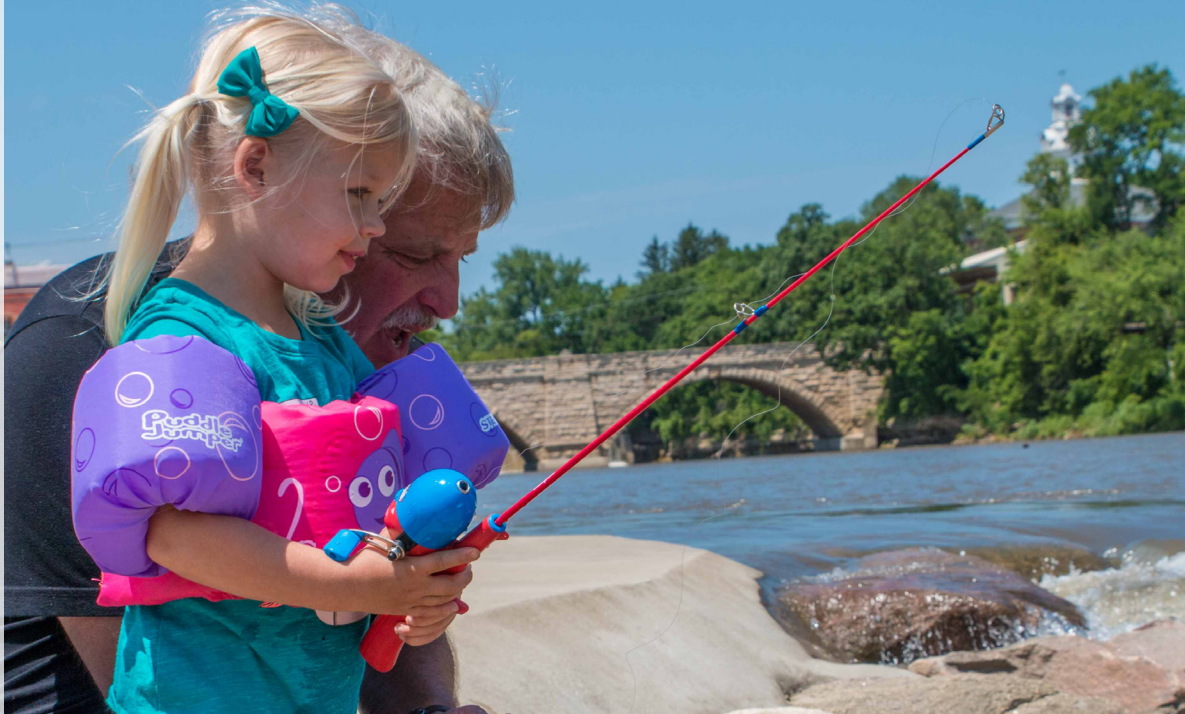
Fishing at the Elkader Whitewater Park - Elkader, Iowa