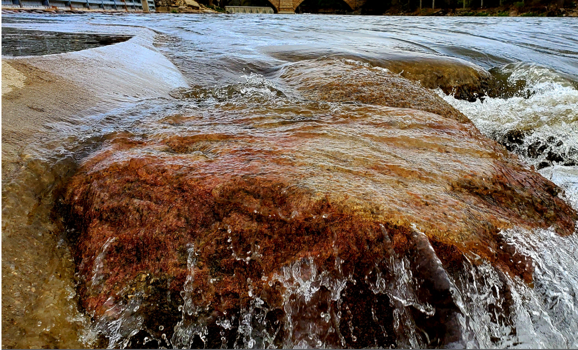
Whitewater Park - Elkader, Iowa