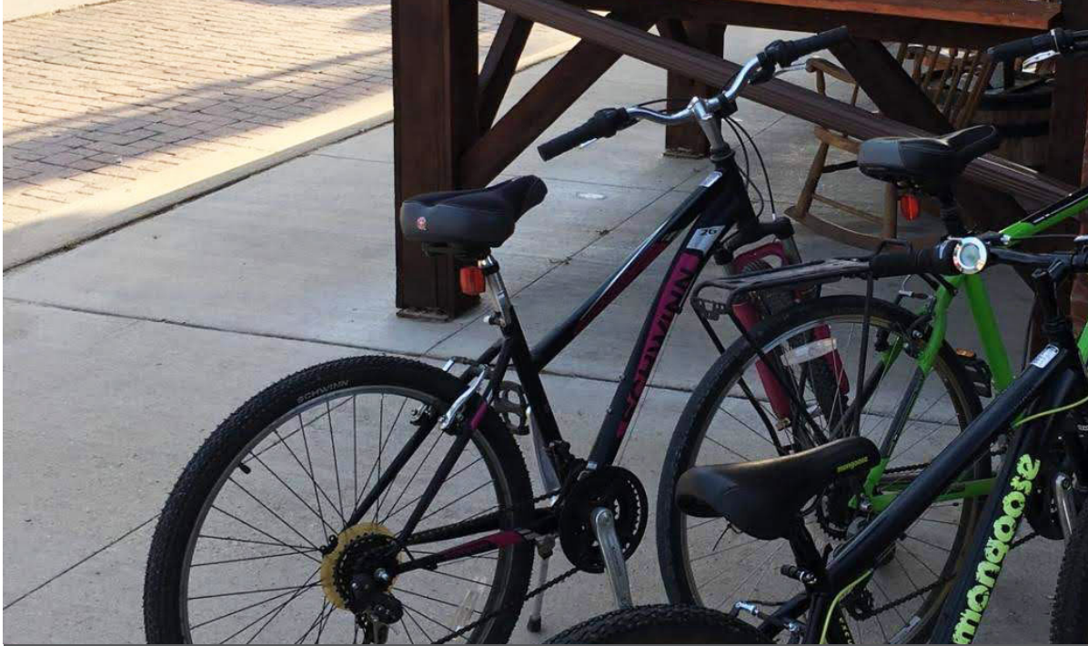
Downtown - Elgin, Iowa