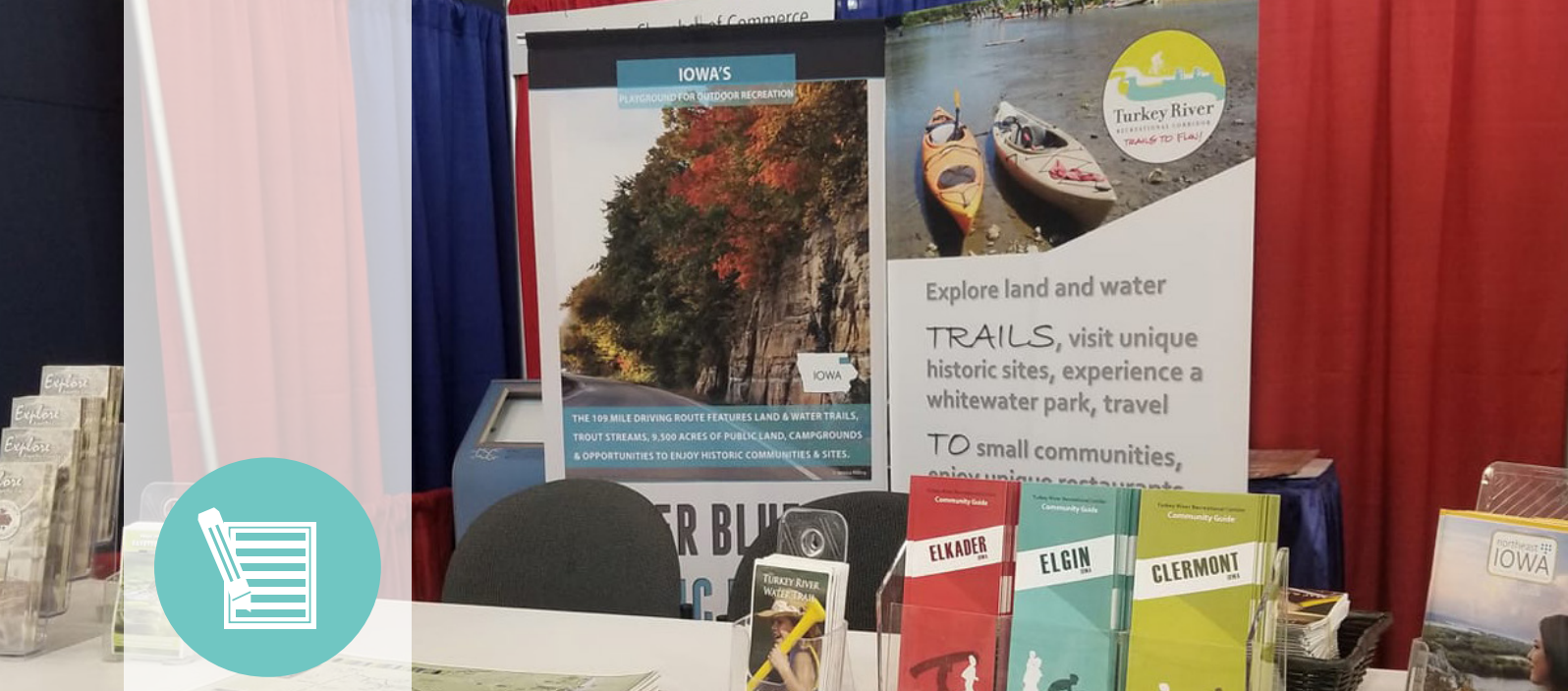
Iowa State Fair - Des Moines, Iowa