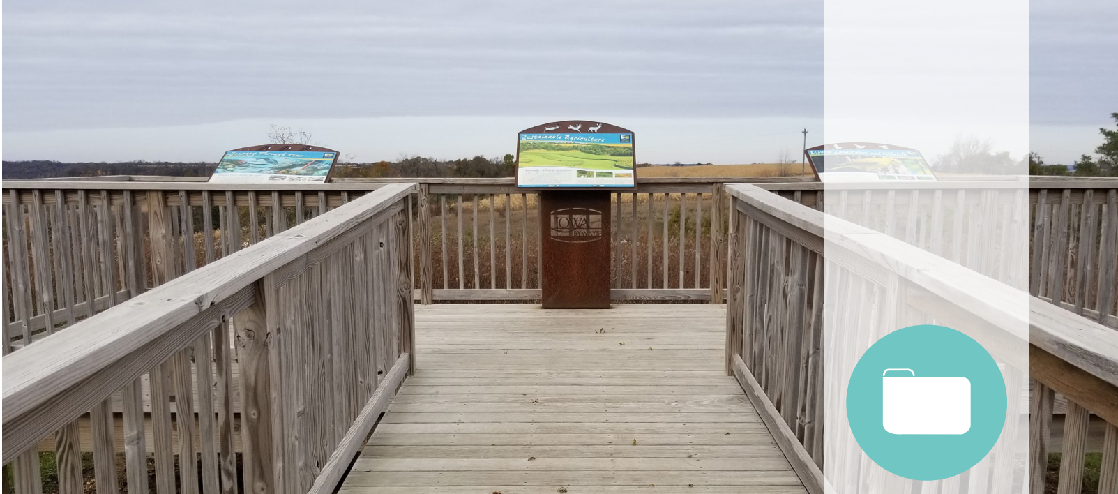
Chicken Ridge Overlook - Elkader, Iowa