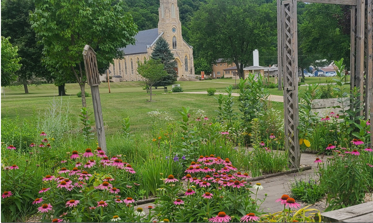
Founders' Park - Elkader, Iowa