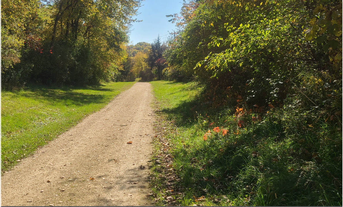
Pony Hollow Trail - Elkader, Iowa