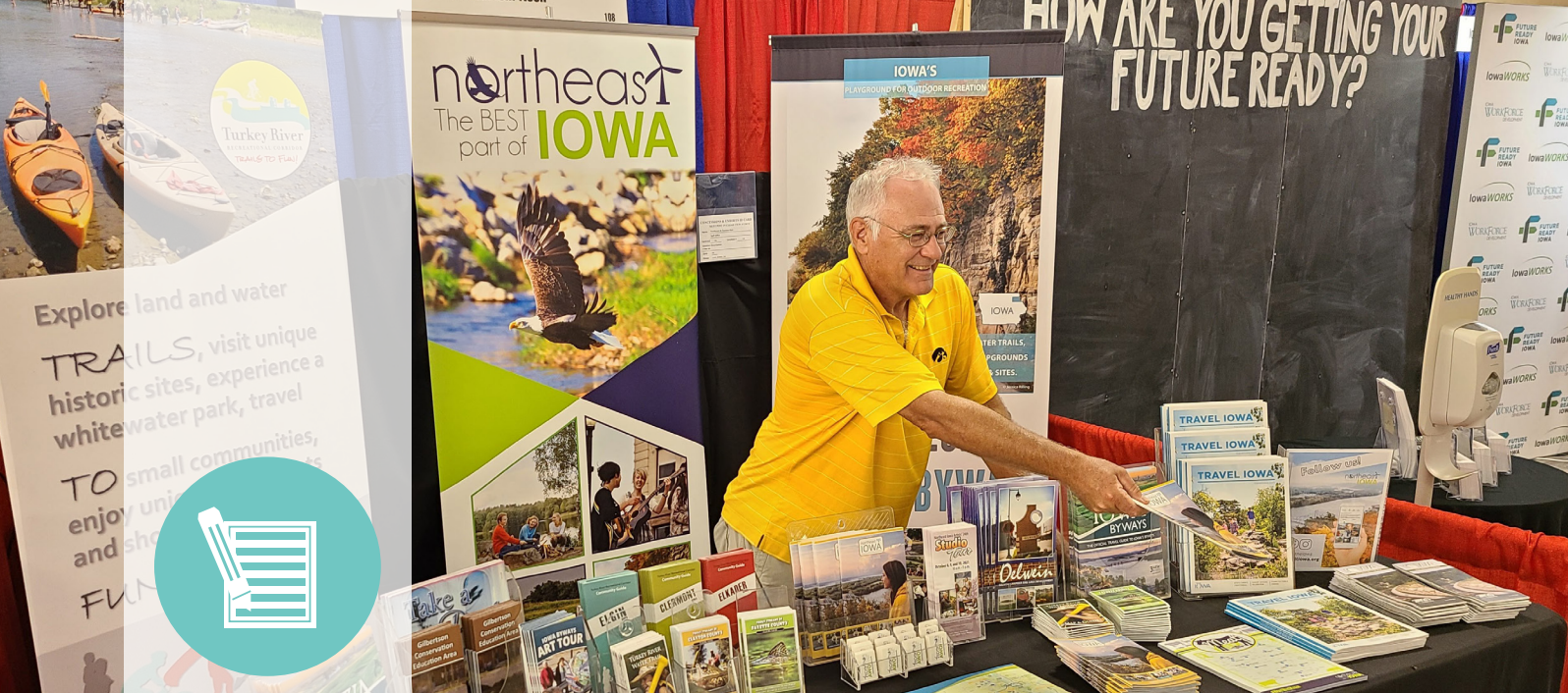
2021 Iowa State Fair - Des Moines, Iowa