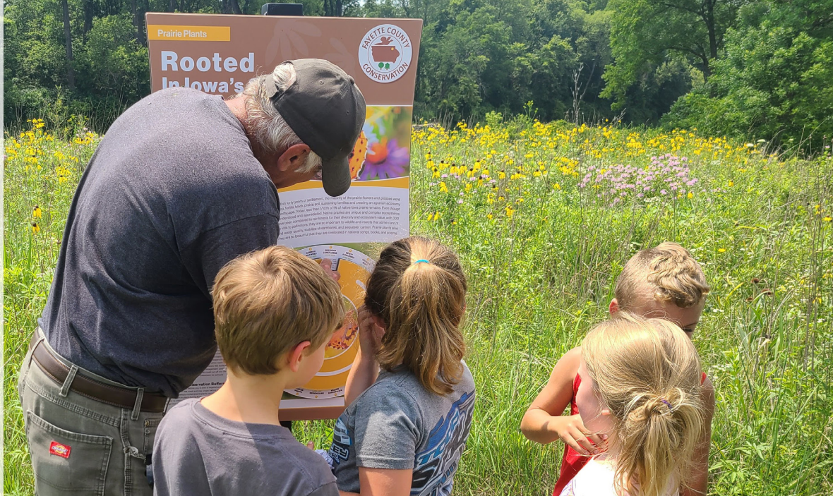
Interpretation along the TRRC Trail - Elgin/Clermont, Iowa