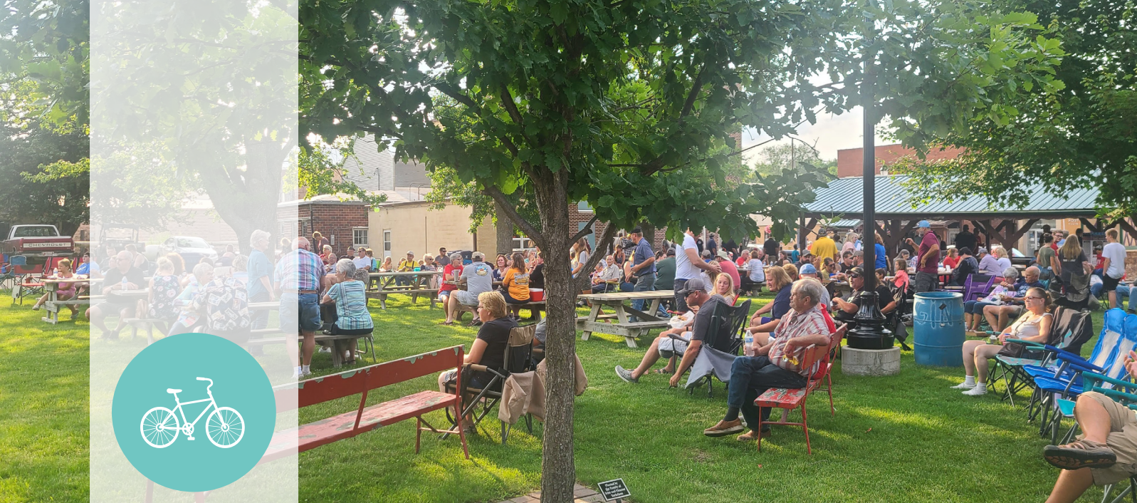
Music and BBQ in the Park - Elgin, Iowa