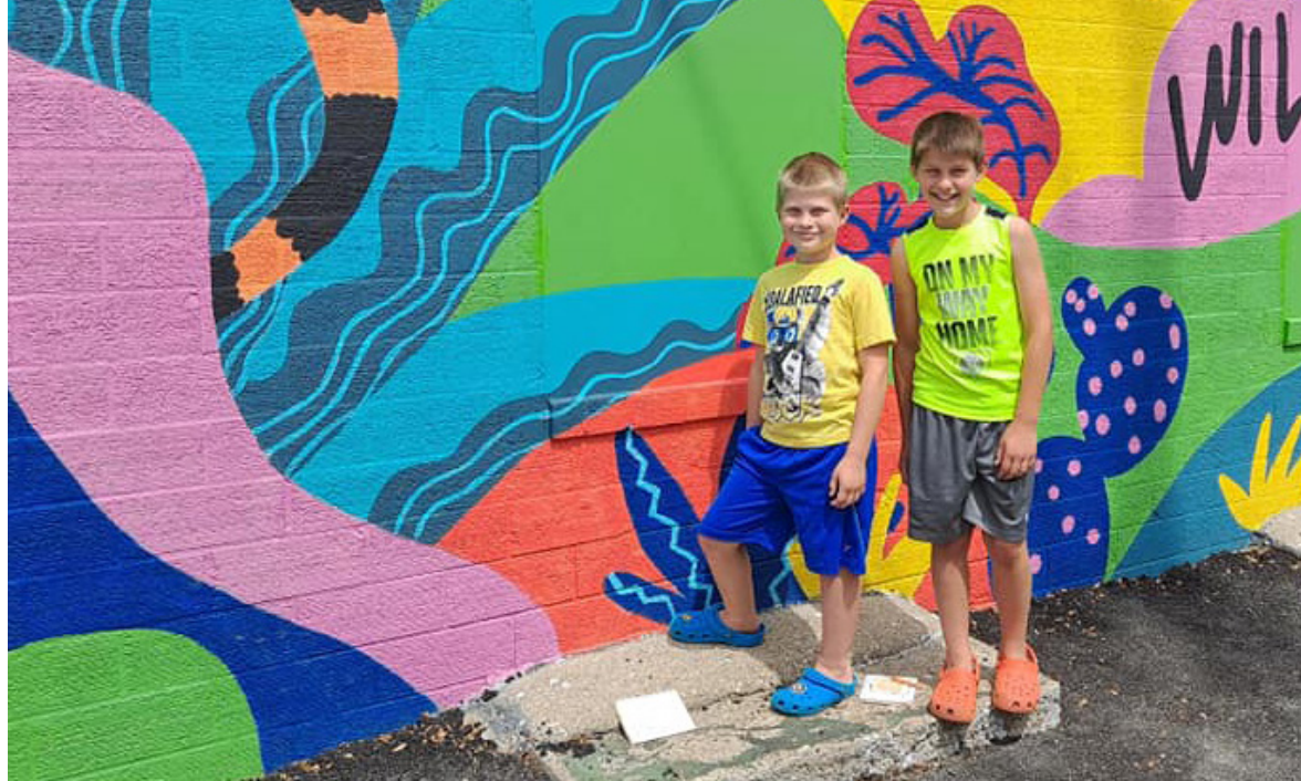
Turkey River Safari Participants - Elkader, Iowa