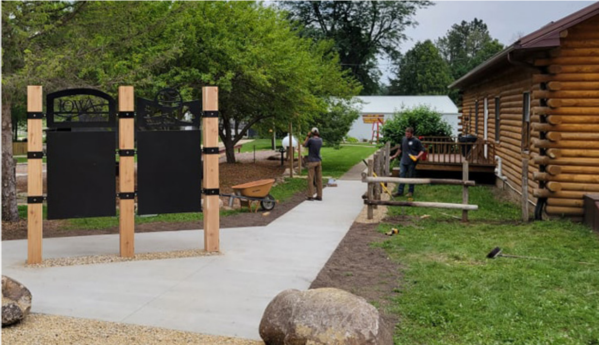
Regional Interpretive Hub - Elgin, Iowa